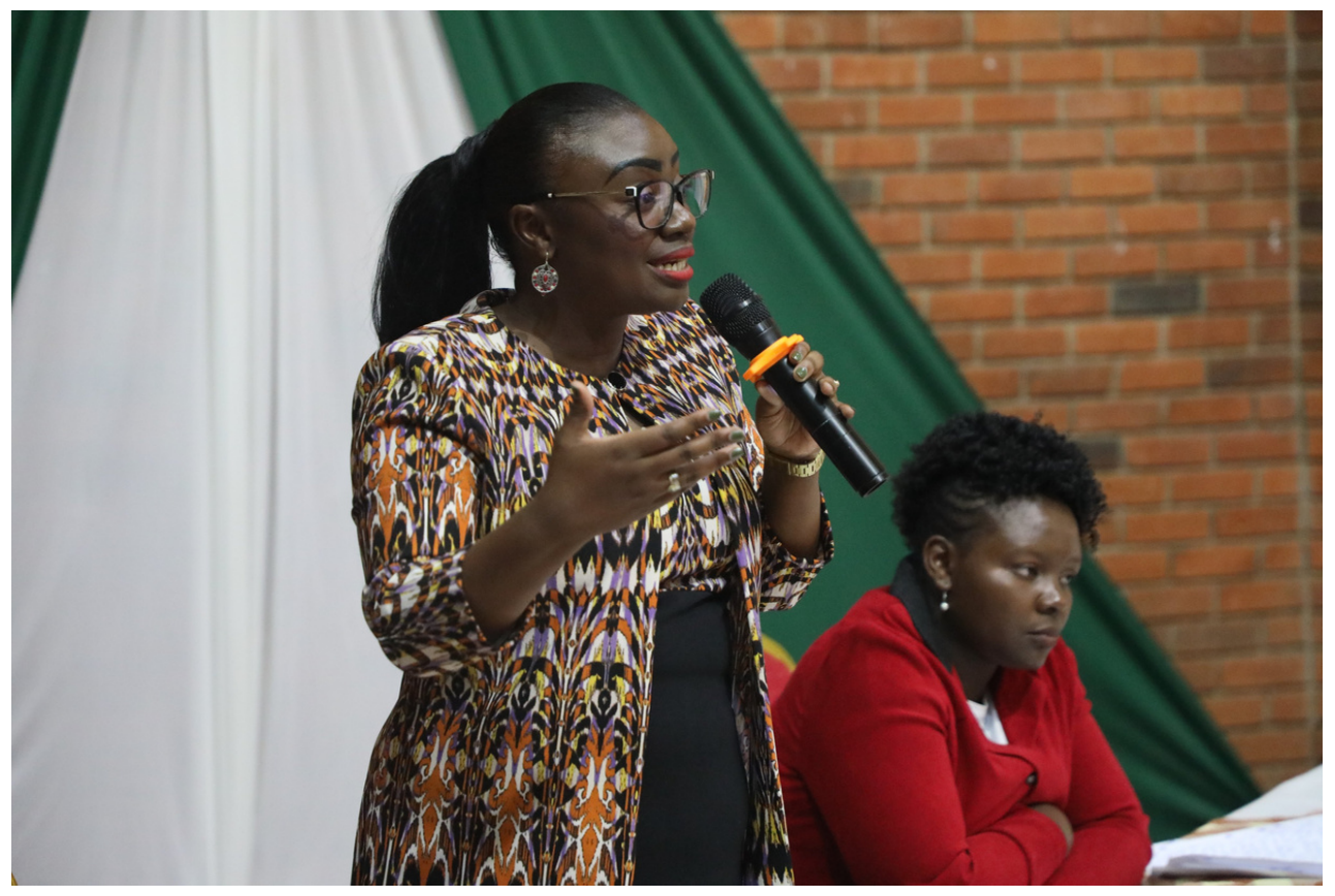
Senator Gloria Orwoba during the launch of the State of Housing Report Vol. 3 by Haki Jamii