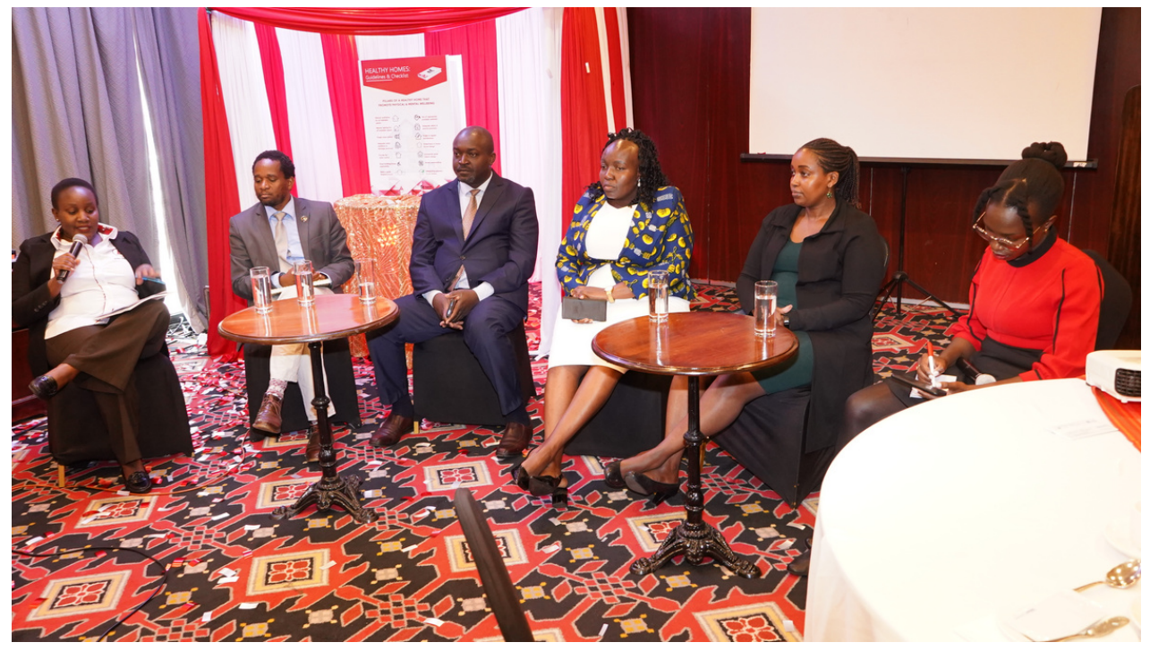
Panel discussion during the launch of the Healthy Homes: Guidelines and Checklist