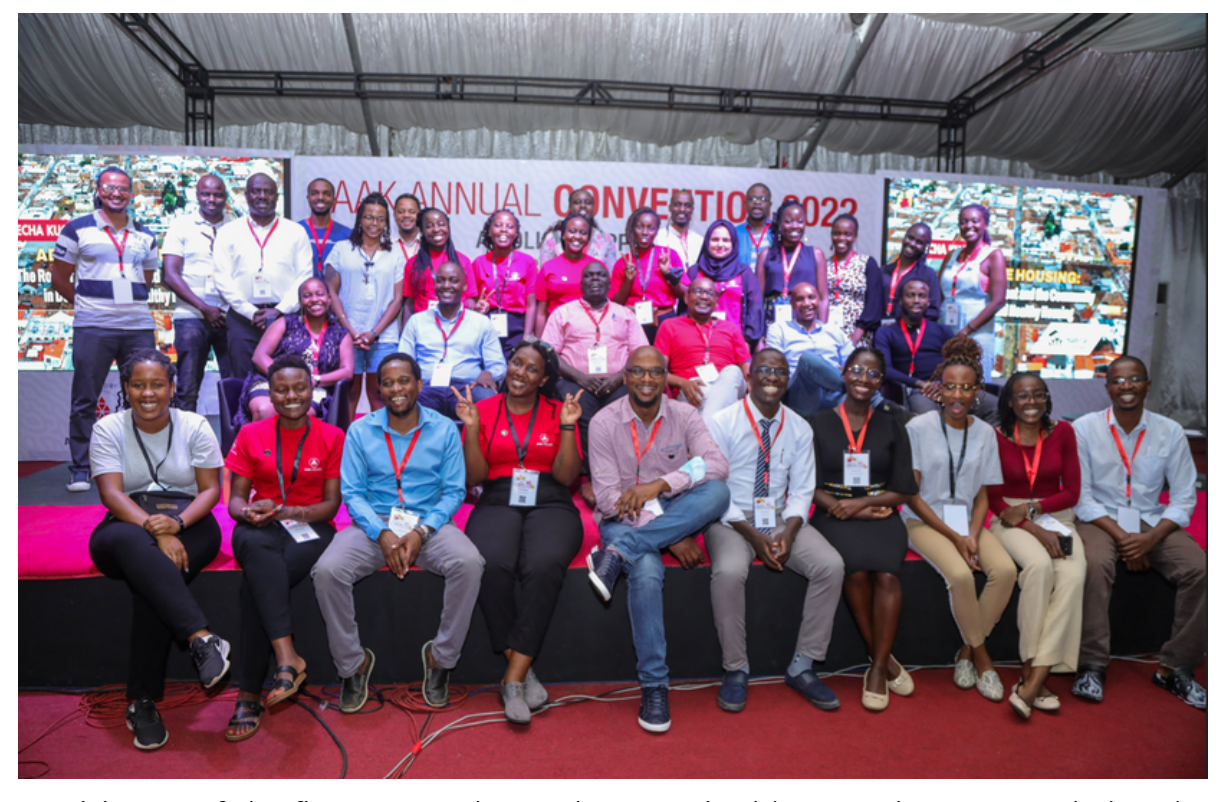
Participants of the first-ever Pecha Kucha organized by R&A department during the annual AAK Convention 2022