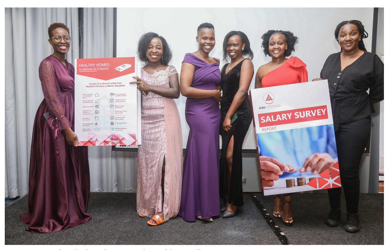
AAK Secretariat during the annual President's dinner 2022