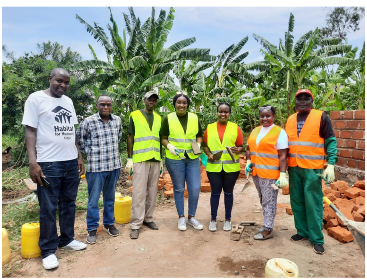
R&A team taking part in the construction of a house by Habitat for Humanity Kenya in Homabay County