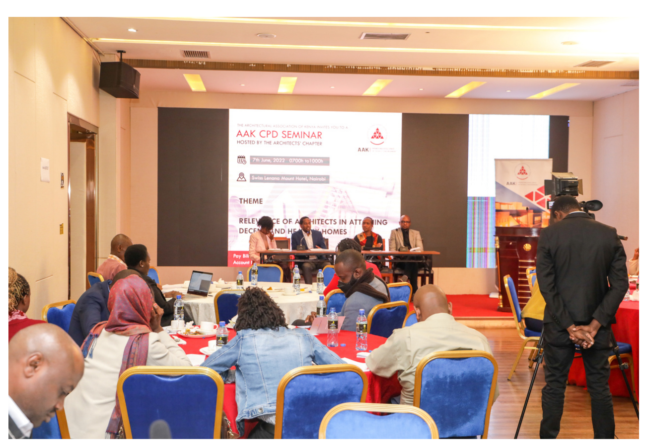
Architect's Chapter Je, Una Mjengo? CPD Seminar