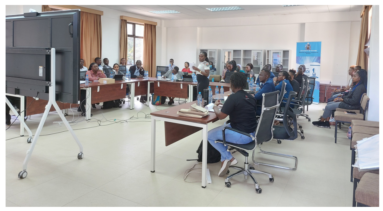
Hybrid session during the AAK/UN-Habitat Urban Thinkers Campus 7.0